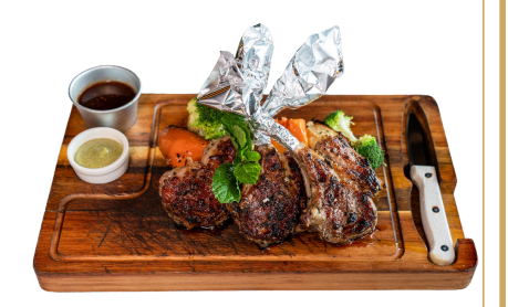
LAMB RACK 澳洲烤羊扒