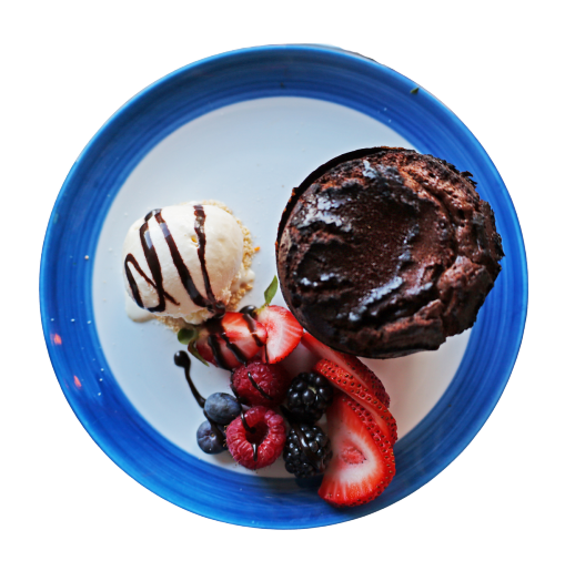
LAVA CAKE 朱古力心太軟

WIFI: Harbourviewgrill_Guest PW: Harbour@1