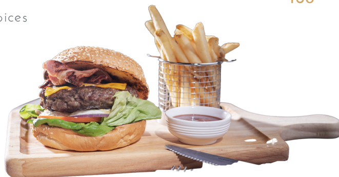
ULTIMATE BEEF BURGER 炭燒牛肉漢堡