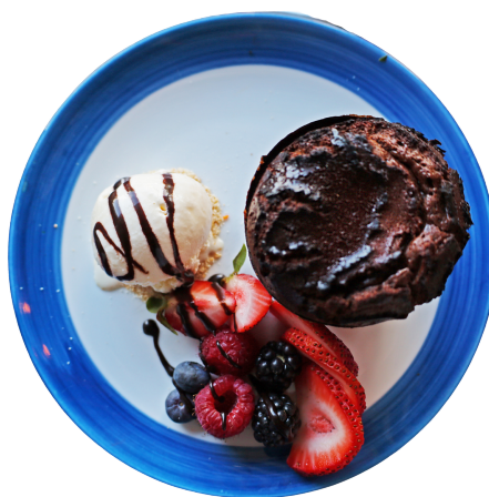
LAVA CAKE 朱古力心太軟