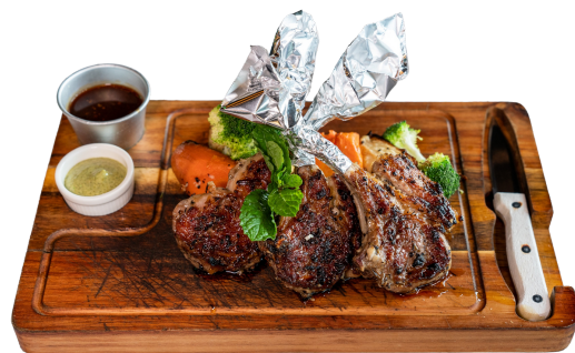
LAMB RACK 澳洲烤羊扒