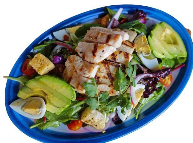
CHICKEN AVOCADO SALAD 雞肉牛油果沙律

Fresh garden salad with feta and black olives with house vinaigrette dressing add chicken or smoked salmon (+20)